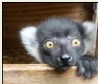
A black-and-white ruffed lemur was recently born at the Detroit Zoo. There are only about 215 of these endangered animals in North American zoos.