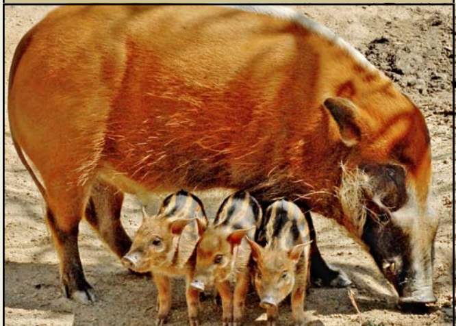
The Los Angeles Zoo recently had three red river piglets. This litter, one male and two females, marks the fourth litter for the parents.

ering from a stroke is back on display at the Reid Park Zoo . Kitabu, who is 18, appeared to have weakness on the right side of his body when he tried to move.