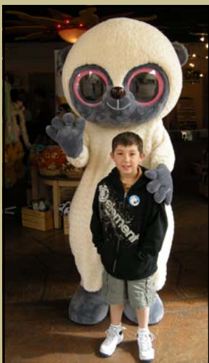
Photo opps with a Yoo Hoo prove to be popular.

Faux vs. Real in our industry is always the way to go. Fake animal prints are produced in such a way that they look as real as ever.