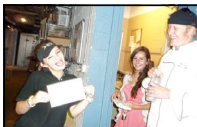
come an award-winning